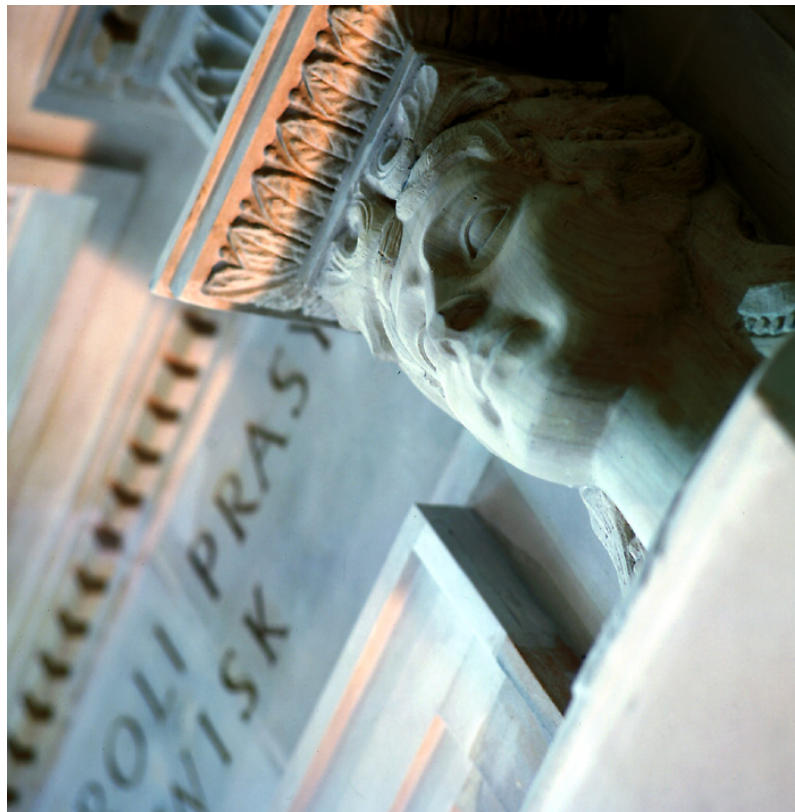
Liberty Corner detail