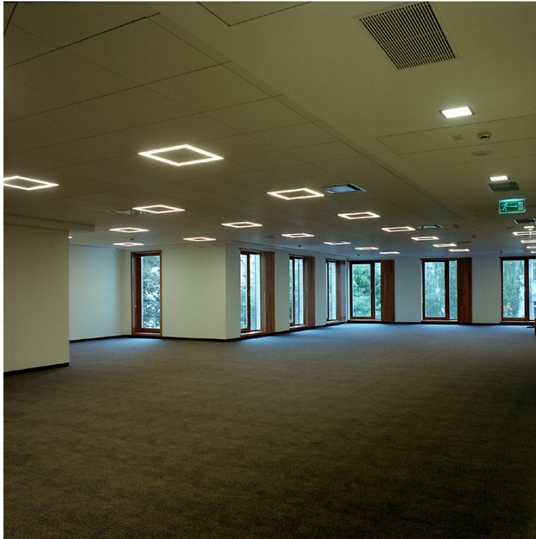
Liberty Corner office space