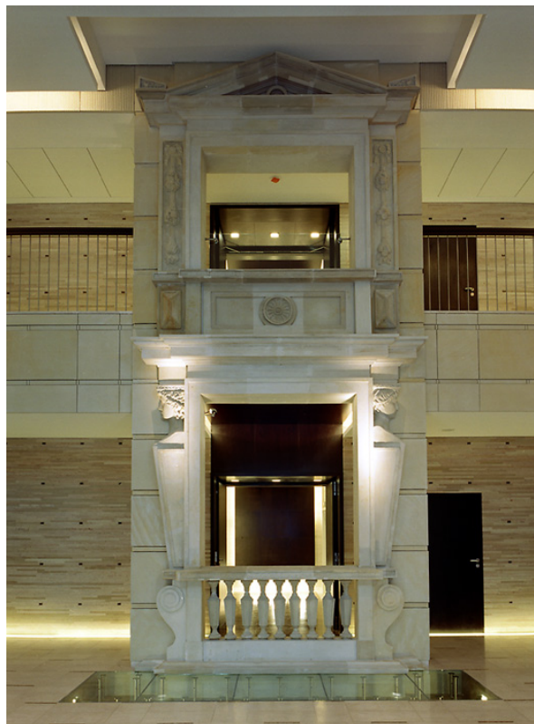
Liberty Corner Lobby