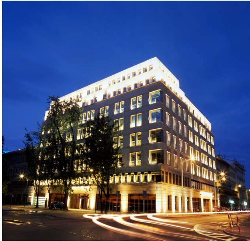
Liberty Corner by night