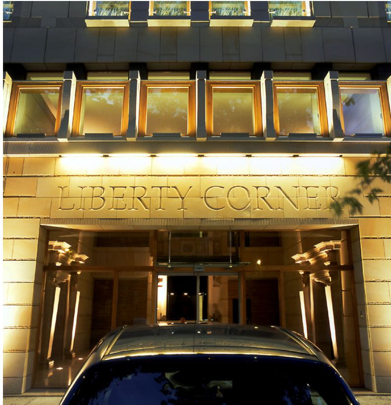
Liberty Corner entrance