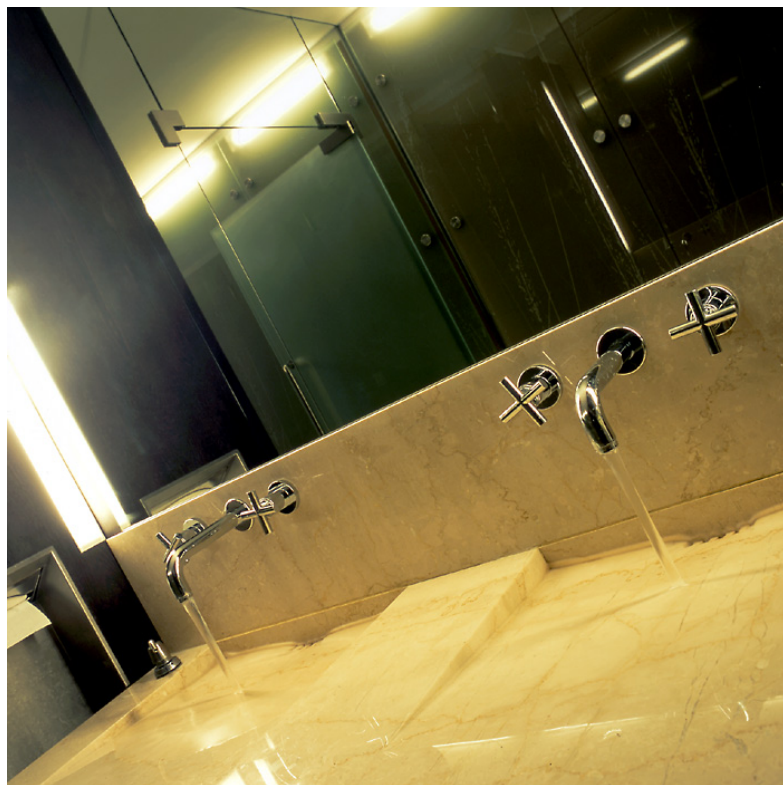
Liberty Corner bathroom